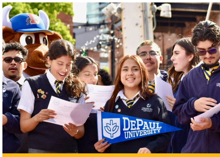
2024-2025 College Signing Day on the American Tobacco Campus

61% of Our Graduates Passed an AP Exam Compared to 21% at Neighboring Public Schools